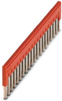
Plug-in bridge, pitch: 5.2 mm, number of positions: 20, color: red

Please be informed that the data shown in this PDF document is generated from our Online Catalog. Please find the complete data in the user documentation. Our General Terms of Use for Downloads are valid.